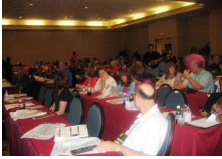
Attendees settle in for an interesting and informative educational workshop!