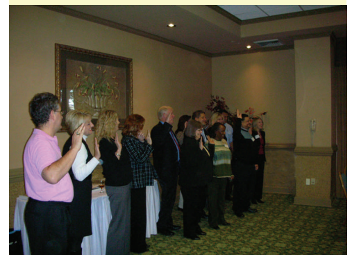
FTECPM Officer's Sworn In